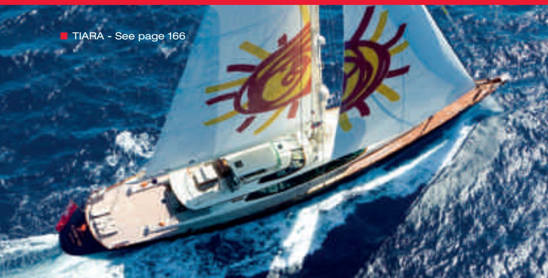
■ TIARA - See page 166