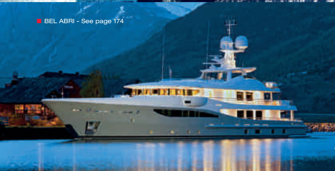
■ BEL ABRI - See page 174