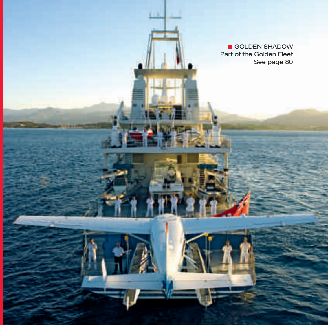
■ GOLDEN SHADOW Part of the Golden Fleet See page 80